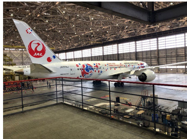
Myaku-Myaku Jet No. 2