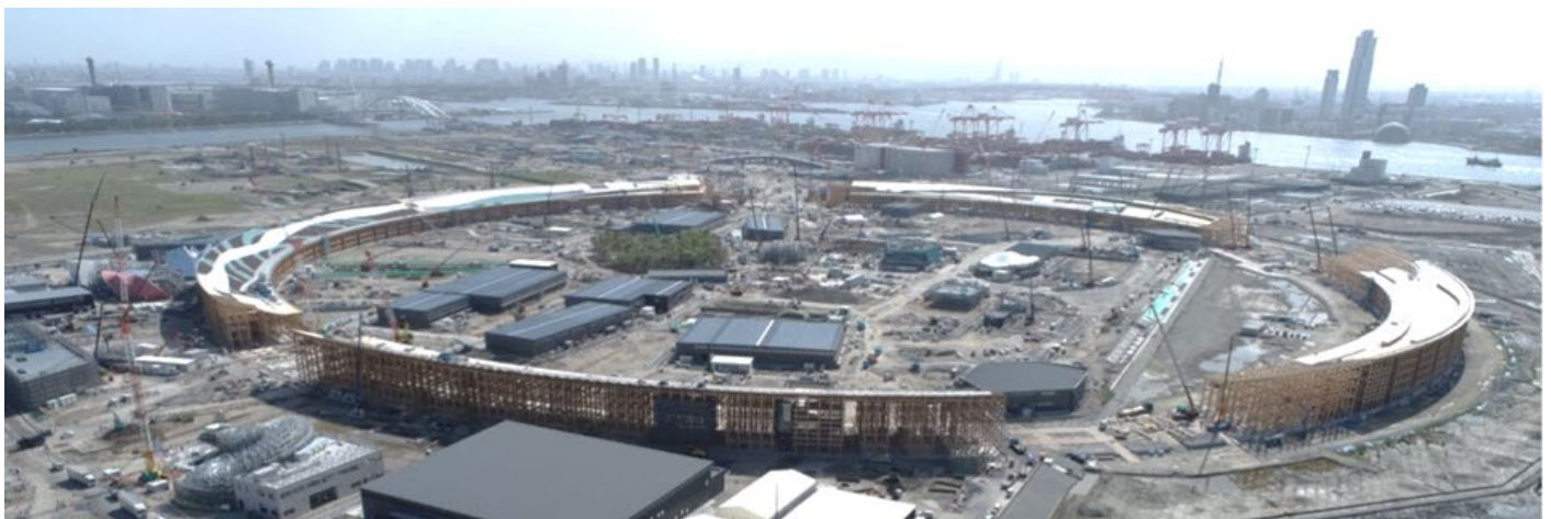
View of the Grand Ring, as of April 19

https://www.expo2025.or.jp/news/news-20240530-01/