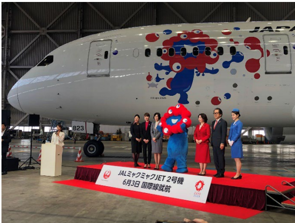
Minister Hanaoko Jimi at the unveiling ceremony