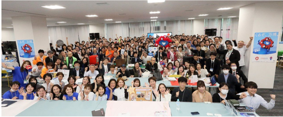
TEAM EXPO 2025 Meeting

https://x.com/expo2025_japan/status/1795756975868838178?t=zTaIvHTIGN_UnbMIIG6w1A&s=19