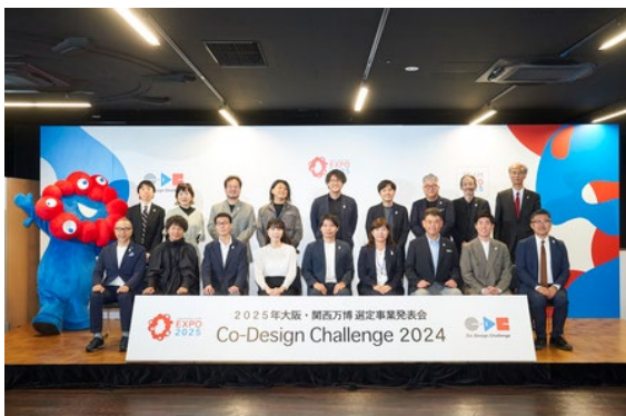
Presentation in Suminoe Ward, Osaka