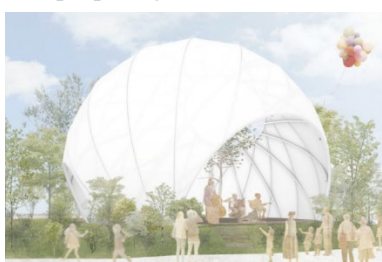
○Pop-up Stage East Outside