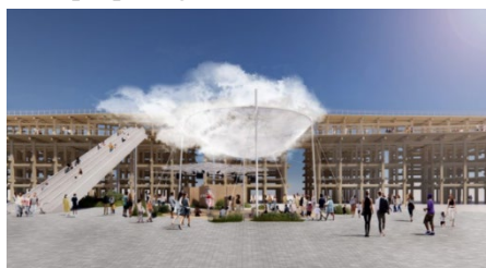
○Pop-up Stage East Inner