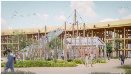
○Pop-up Stage North