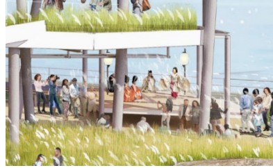
○Pop-up Stage South