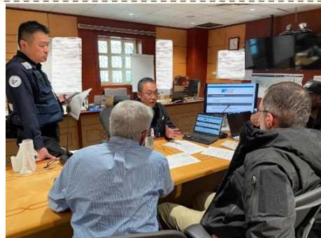
Briefing of Info management method on stakeholders by JICA specialists.

Within this project, Japan will support hospitals in 9 governorates in Egypt which accept seriously injured patients and newborns from Gaza by providing medical supplies and equipment, technical support and training for capacity building of hospitals and medical staff, and additional support for risk communication and community engagement among the governorates.