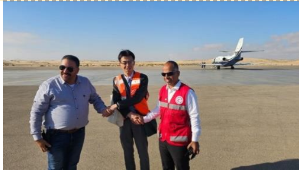
Japan and Egyptian Red Crescent hand-in-hand extend support to people in Gaza.